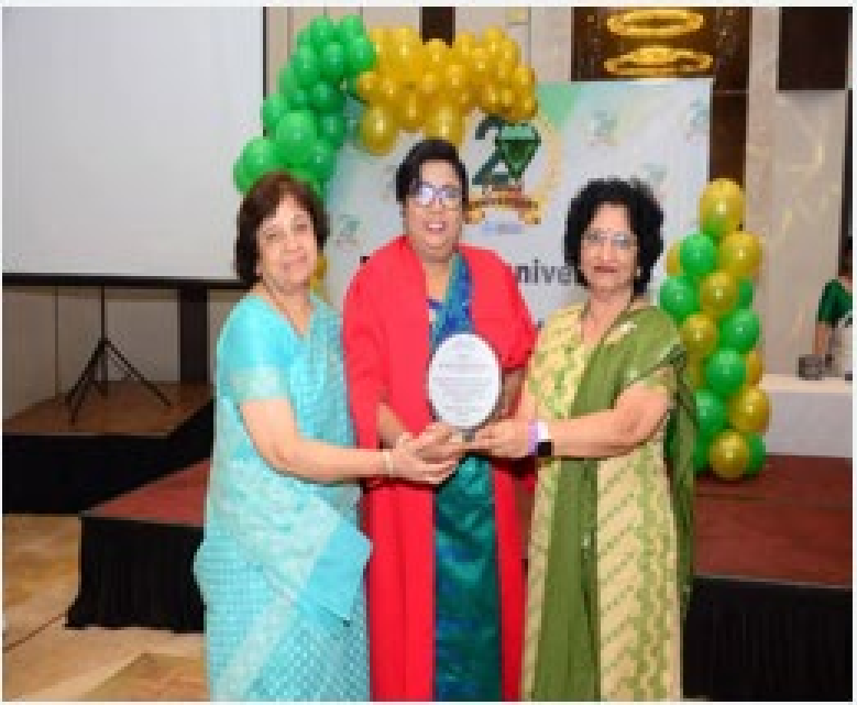
Receiving an Award from AAP