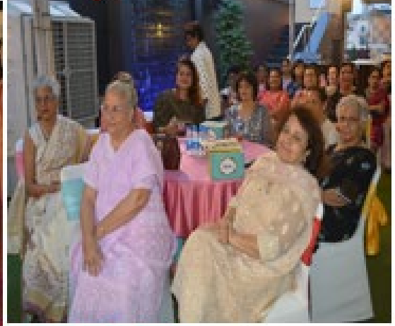
Concluded by Dance & Dinner